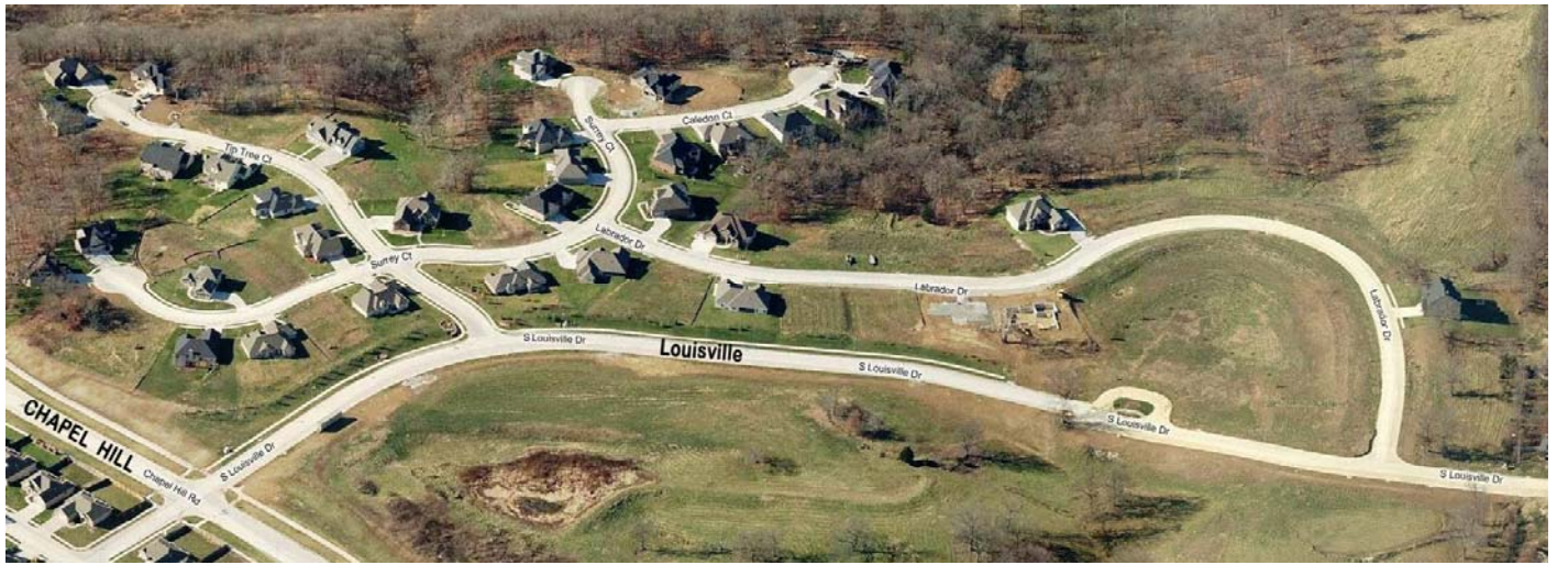
This bird's eye view dates approximately from the spring of 2008.